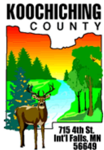
Logo for Koochiching County, Minnesota